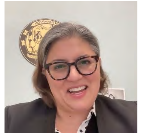
Northampton Mayor Gina-Louise Sciarra