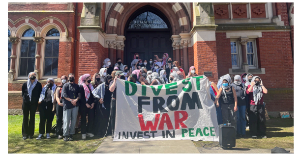
Members of Smith College Students for Justice in Palestine (SJP) end their 13-day occupation of the College Hall administration building on April 9, 2024, moving their protest to the campus lawn.

We, Smith College Students for Justice in Palestine, are here today to hold Smith College complicit in the active genocide and ethnic cleansing occurring in Palestine over the past 24 months. Additionally, we condemn the institution for surveilling students and silencing their voices, and for its failure to uphold its purported values and mission.