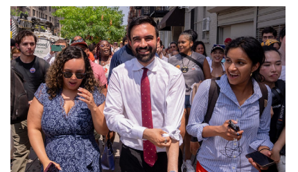
Zohran Mamdani rolls up his sleeves during a campaign event on June 23, 2025, the day before his victory in New York City's Democratic mayoral primary.