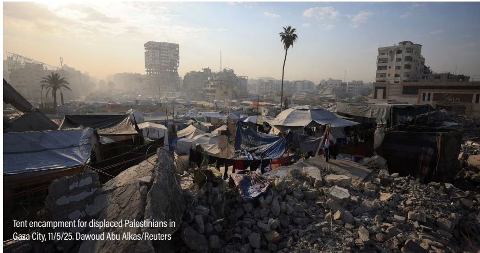
Tent encampment for displaced Palestinians in Gaza City, 11/5/25.

River Valley for Palestine ~ rivervalley4palestine@gmail.com