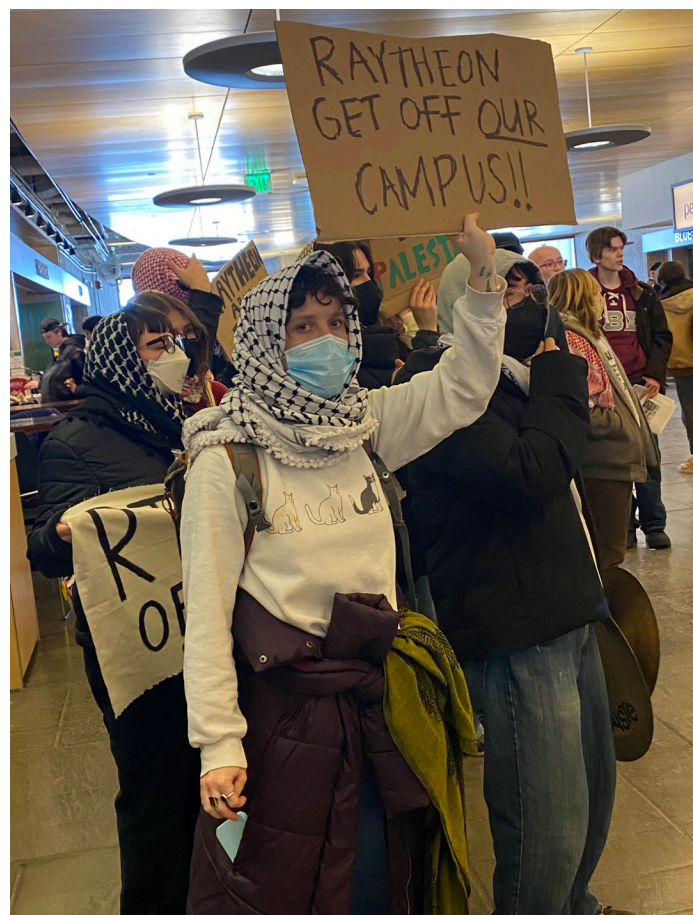
Students arrive at the Campus Center after marching from the Student Union. (Mottern)