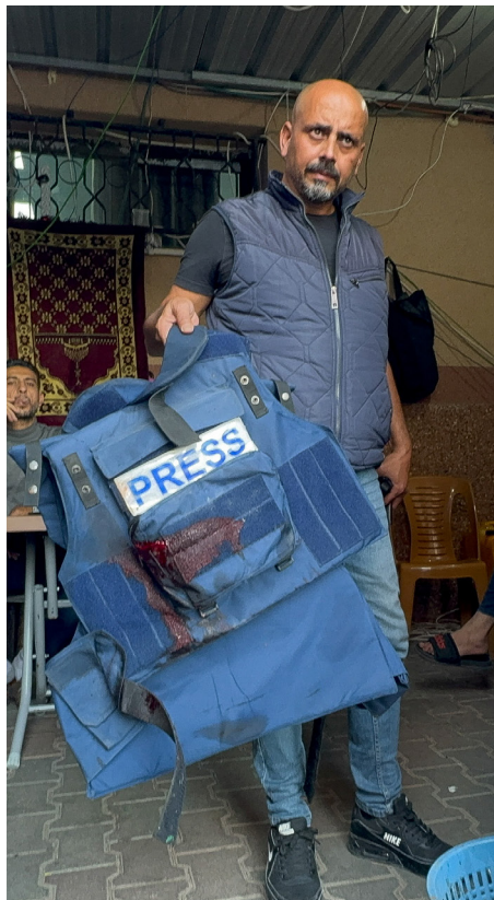
Bloody press vest of a Gaza journalist murdered by the Israel Defense Forces (IDF)

Lastly, as to news articles about the genocide in Gaza: We make a promise to our readers that if we reprint news articles from outlets such as the Associated Press, we will