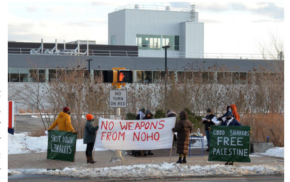
Jewish Voice for Peace W. MA protest at L3Harris, Northampton.